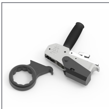
The different sizes of spanners are simple and quick to replace.