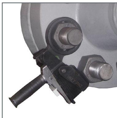
The back-up wrench has an ergonomic handle making it easy to place and move.